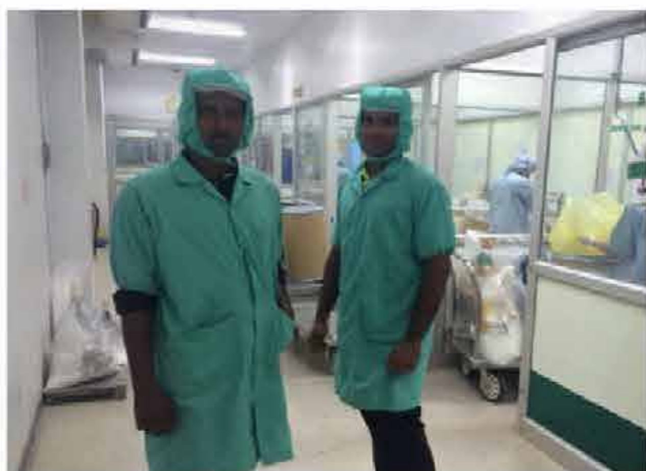
Dangerous Goods Handling