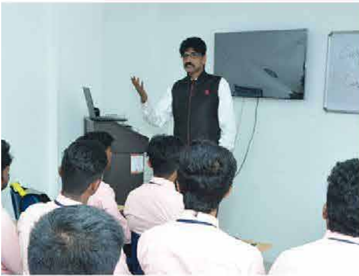
on the topic "Cargo Movements in ent Industry"