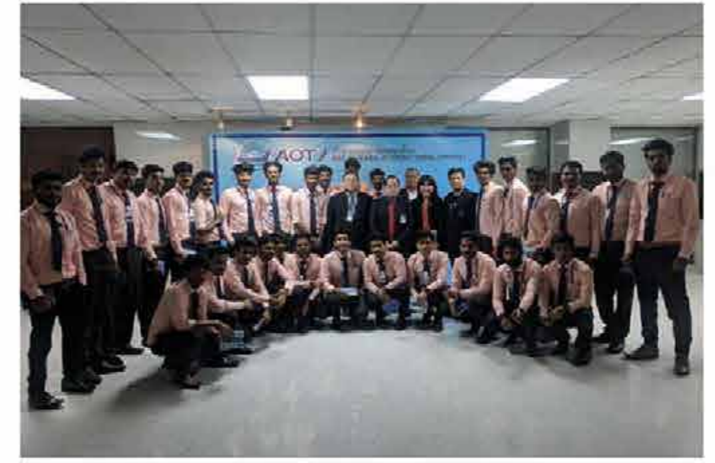
Training on Air Cargo Movement from Airports of Thailand (AOT) PCL, Thailand