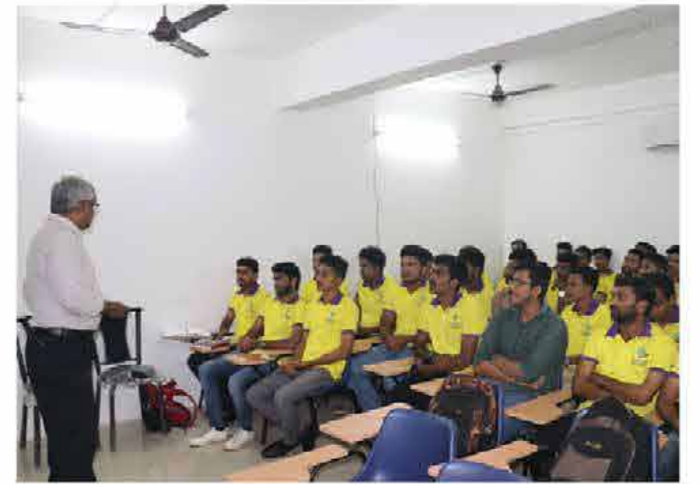
VFL on the topic "Foreign Exchange"