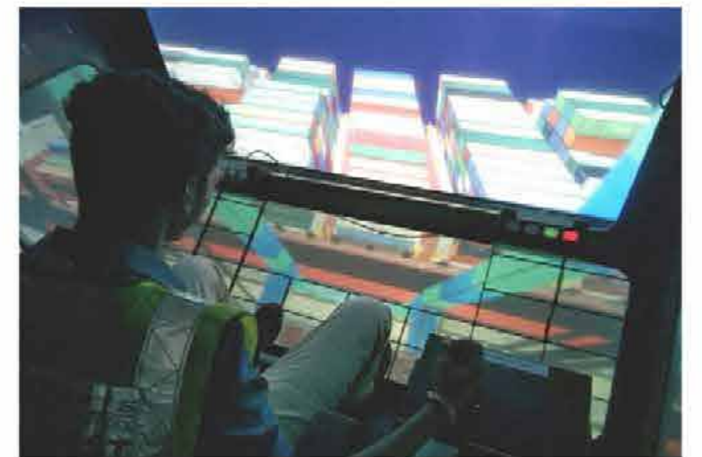
Container Freight Station

TransGlobe Academy is committed to deliver high quality education and student placements. TransGlobe Academy gives high emphasis on student placements by providing more focus on pre-placement activities. We have designed our program with classroom training coupled with mandatory internship training with reputed organizations. TransGlobe Academy believes student undergoing internship at reputed companies will be an added advantage to their career.