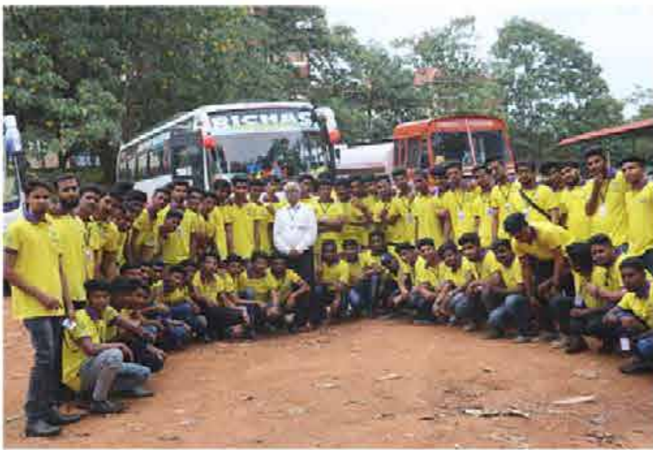
Industry Visit to KiteX Ltd, Aluva