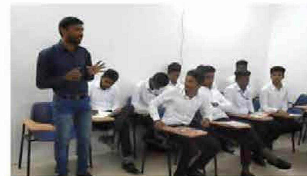
Soft Skills Development