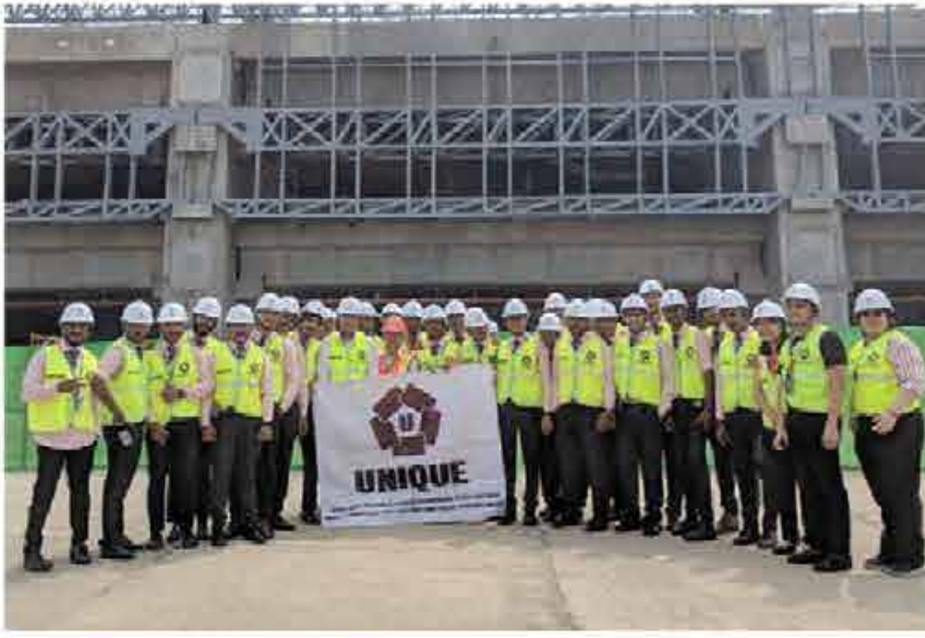
Industry Visit to UNIQUE Engineering & Construction PC, Thailand