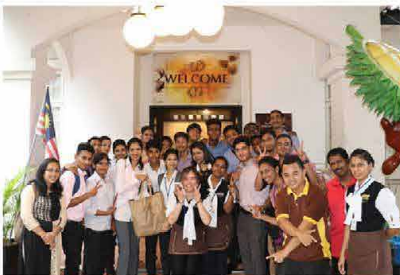
Students at Beryl's Chocolate Kingdom, Kuala Lumpur, Malaysia