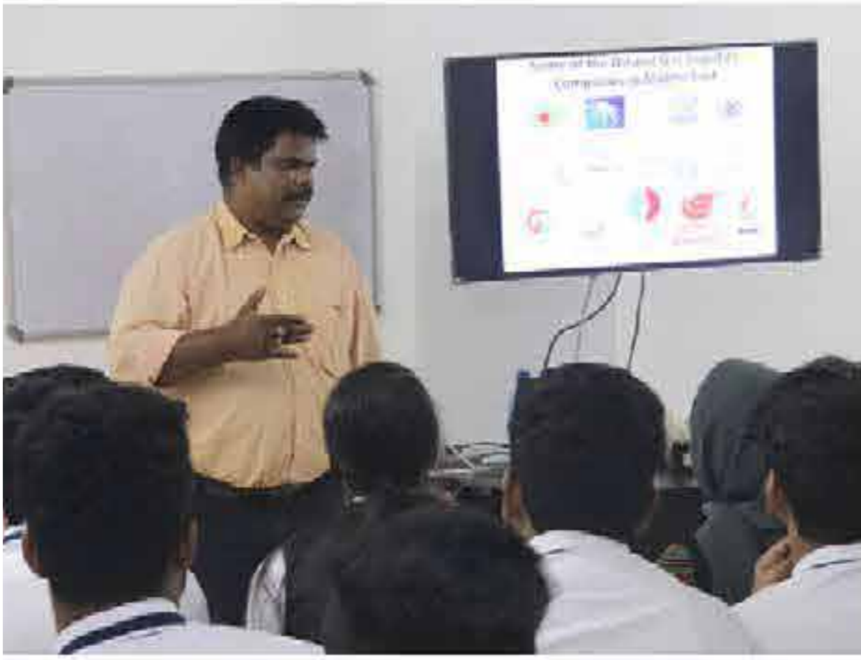
on the topic "Petroleum Logistics"