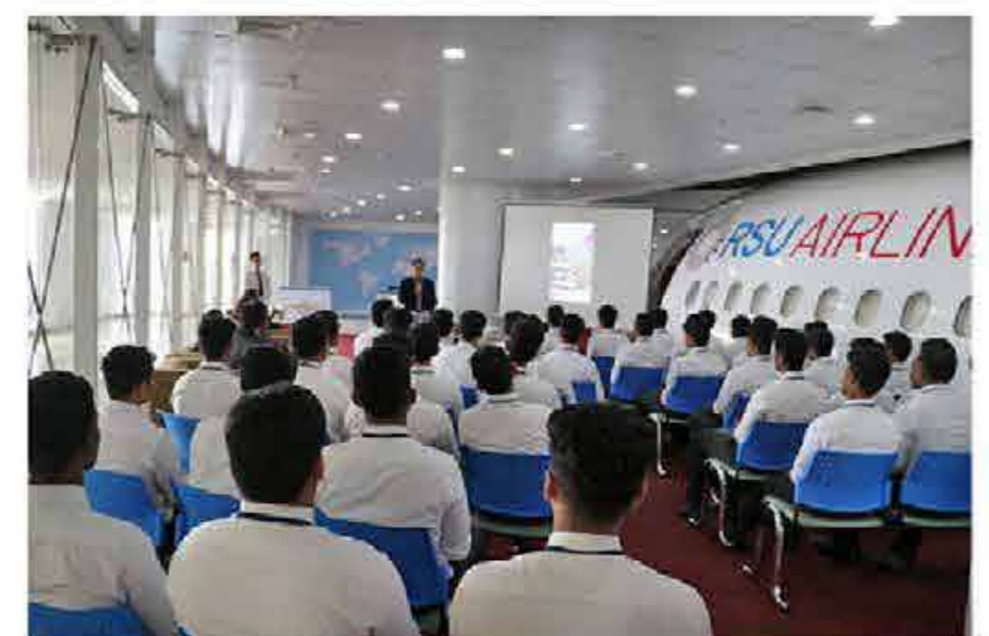
Training at Rangsit University, Thailand