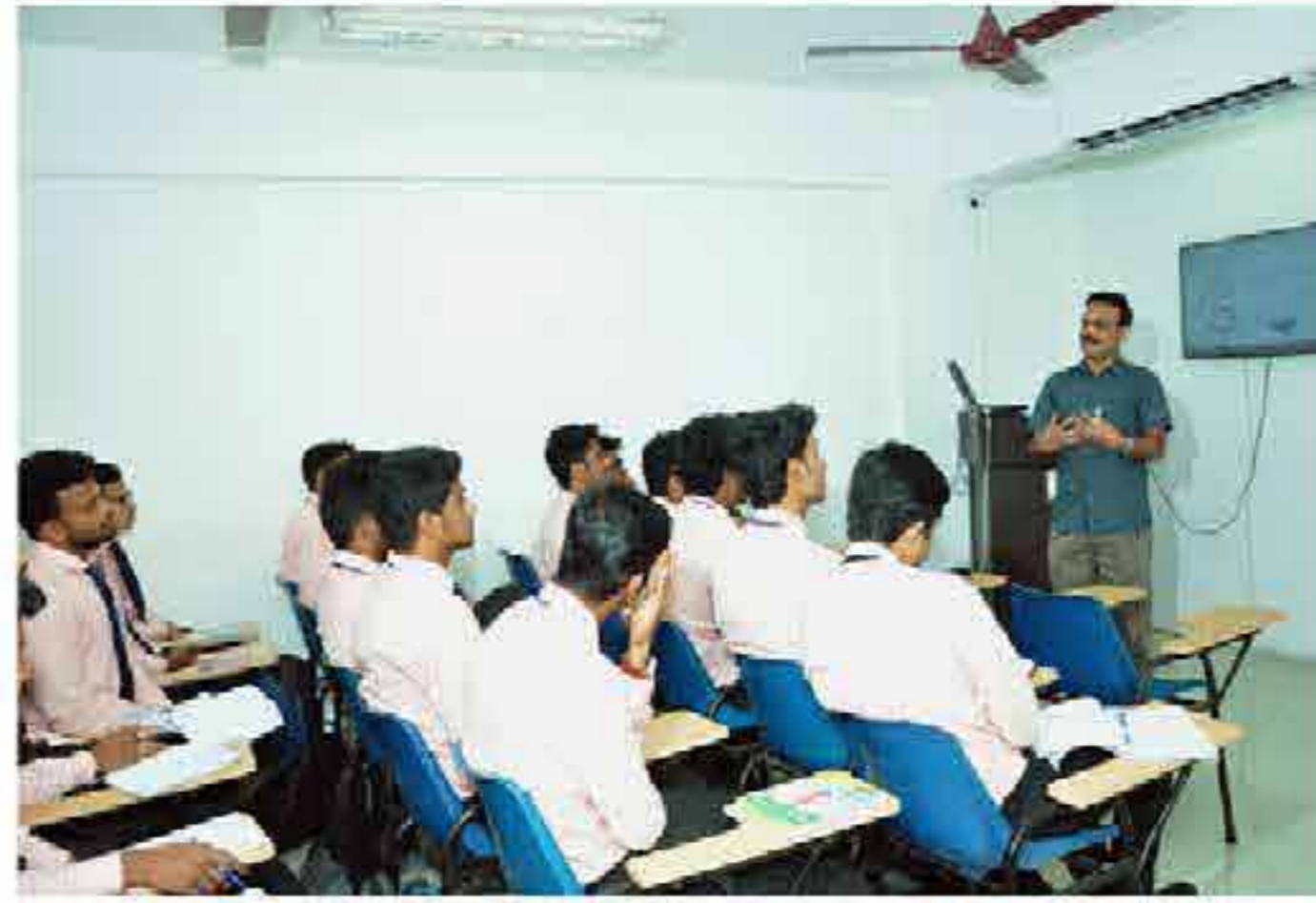
VFL on the topic "GST & Its influence in Logistics Industry"