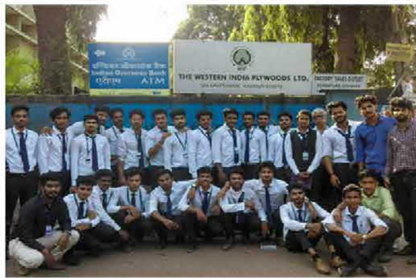
Industry Visit to The Western India Plywoods Ltd, Valapattanam, Kannur