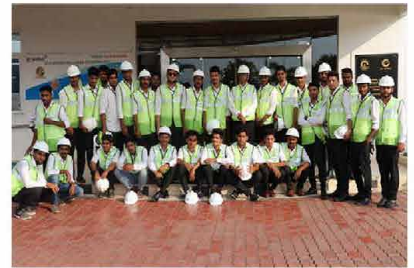
Industry Visit to DP World, Container Terminal, Vallarpadam, Cochin