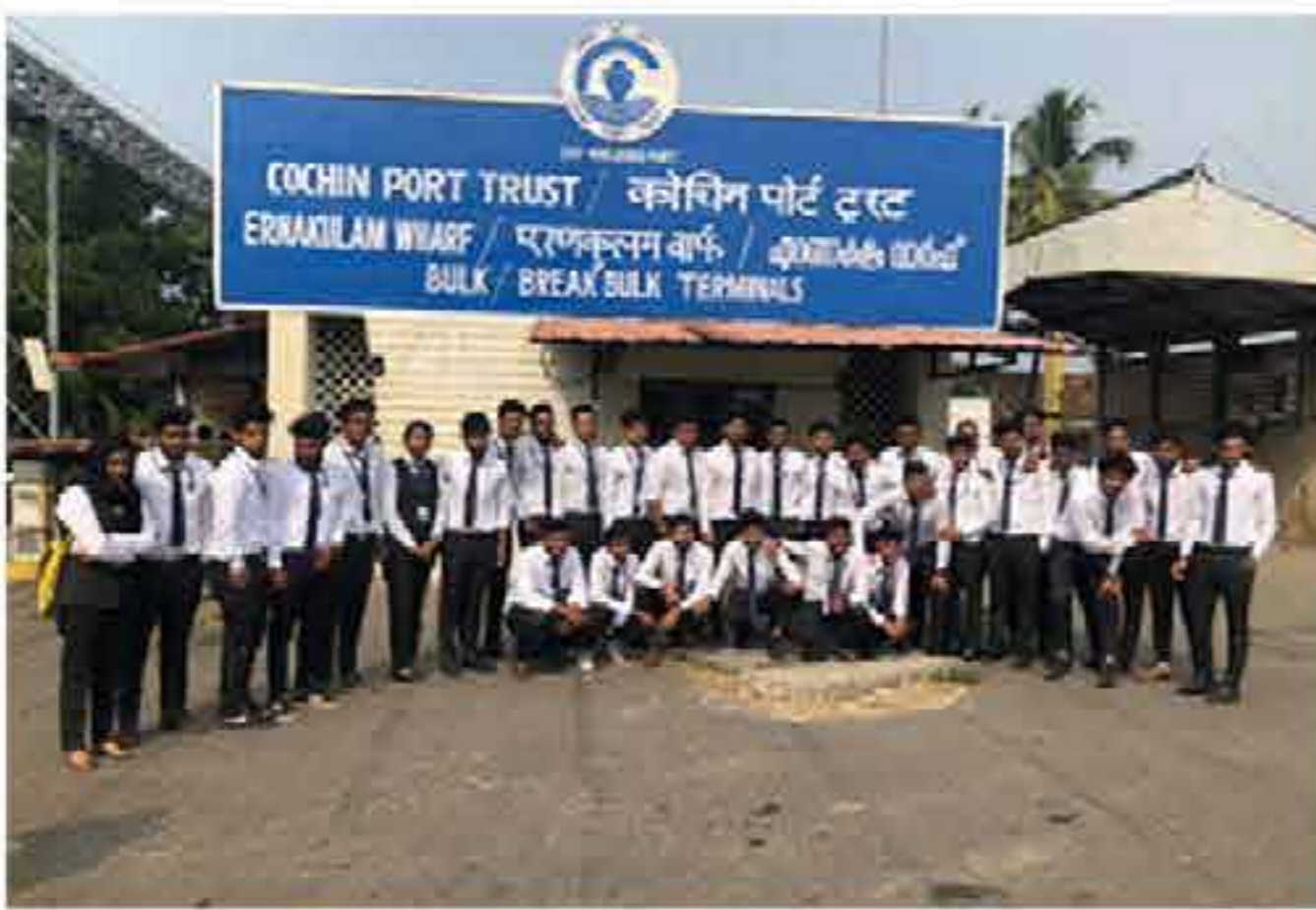
Industry Visit to Cochin Port Trust, Ernakulam Wharf, Bulk/Break Bulk Terminals, Cochin