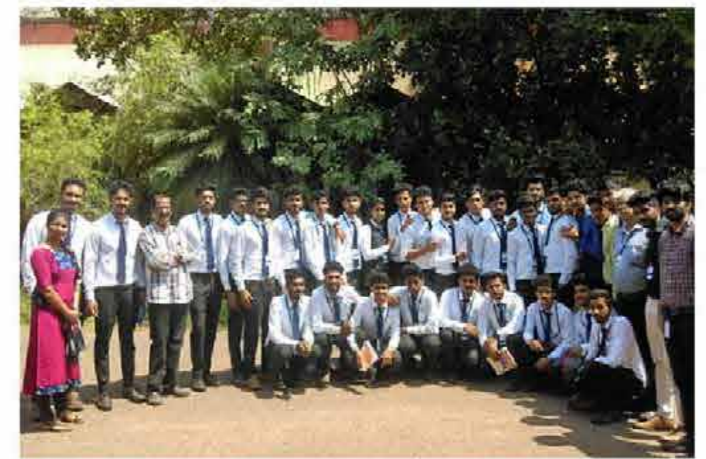
Industry Visit to Rubco Huat Woods Pvt. Ltd Thalassery, Kannur