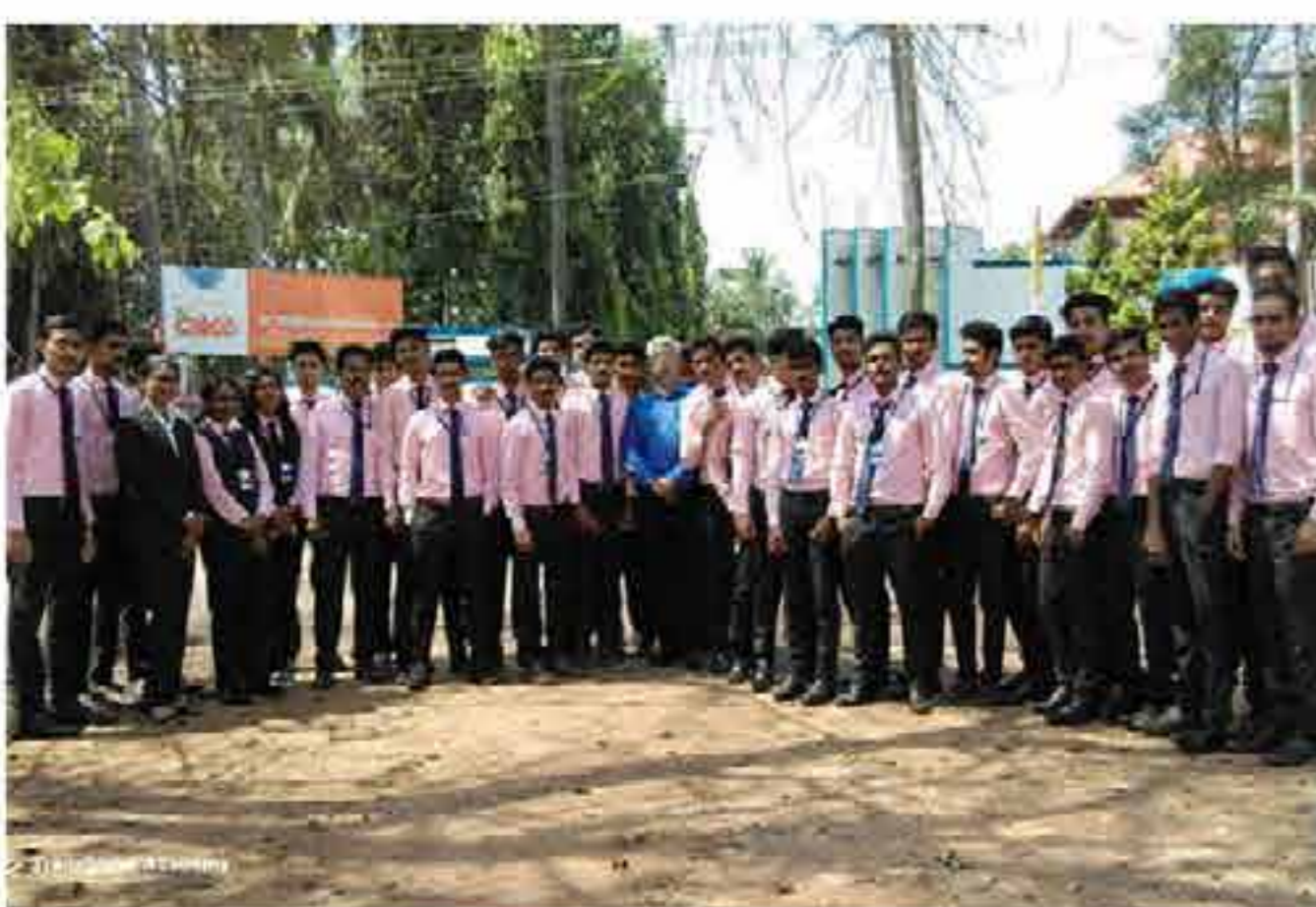
Industry Visit to Caico Foods (The Canning Industries Cochin) Thrissur