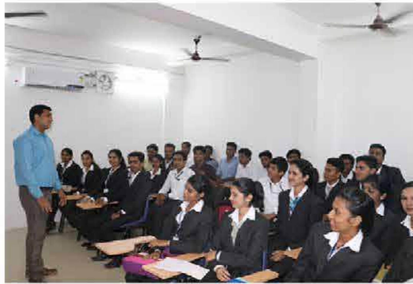
VFL on the topic "Opportunities in Aviation Industry"