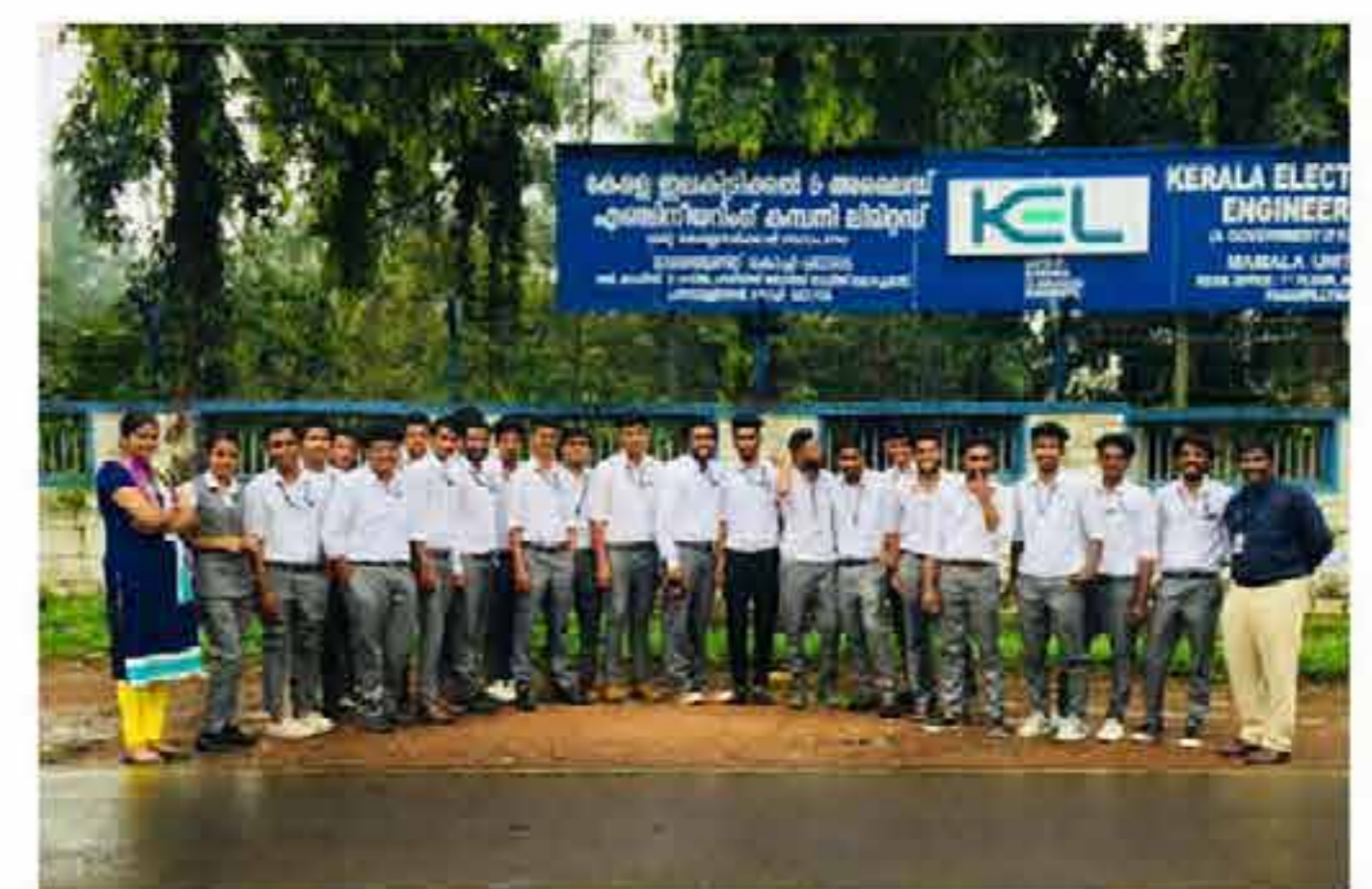
Industry Visit to Kerala Electrical & Allied Engineering Company Ltd (KEL) Mamala Unit Ernakulam