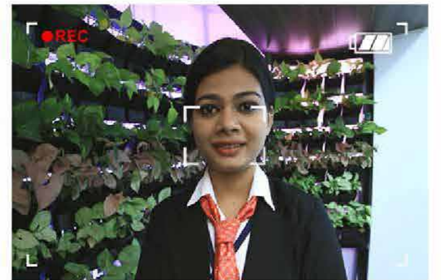
Visual Resume Preparation

TransGlobe Academy is the right place to develop skills. TransGlobe Academy offer Placement assistance to our students who successfully complete training program. Placement team helps students to find the right career in Logistics & Aviation industry within India or abroad