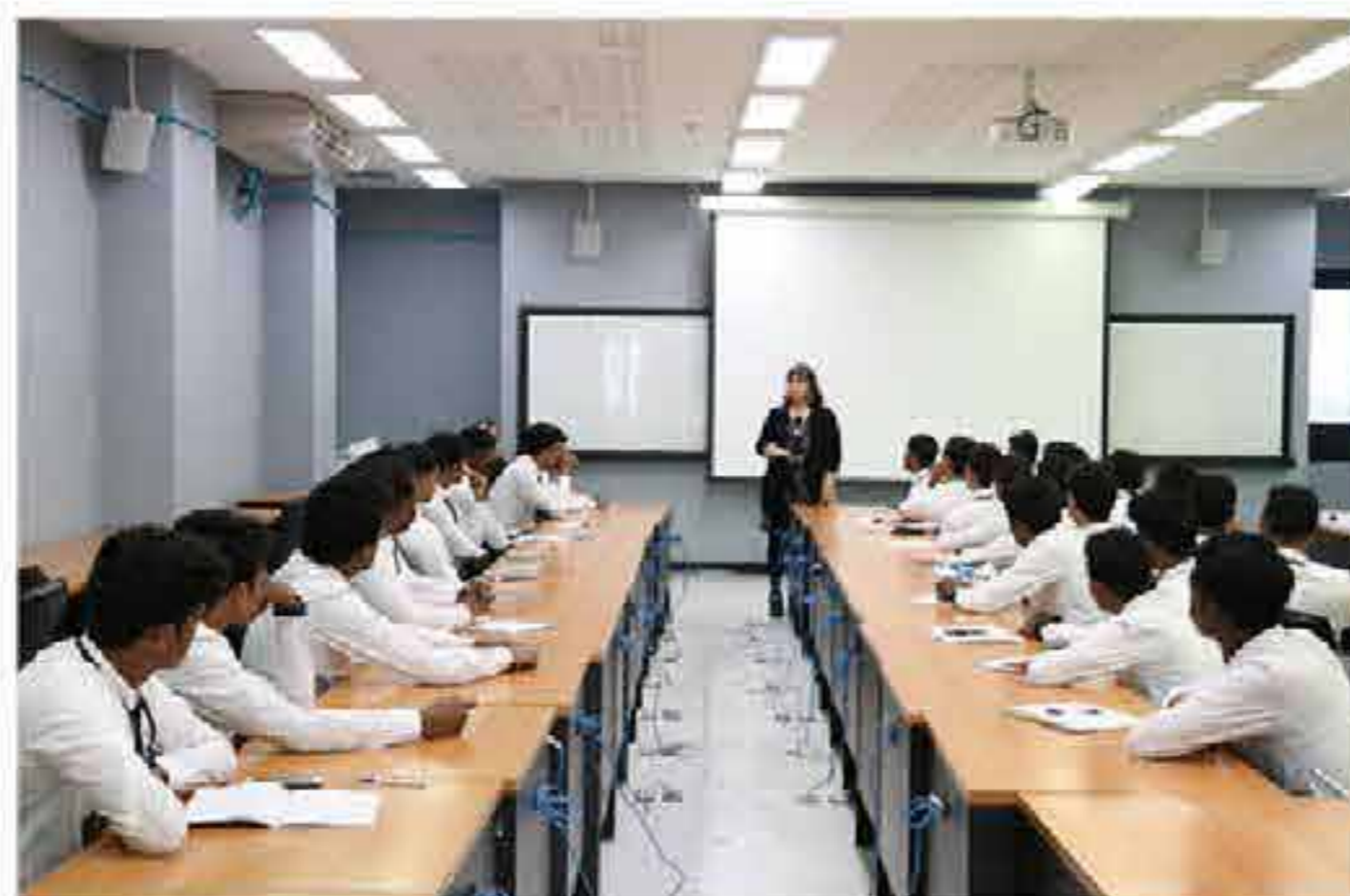
Training at Rangsit University, Thailand