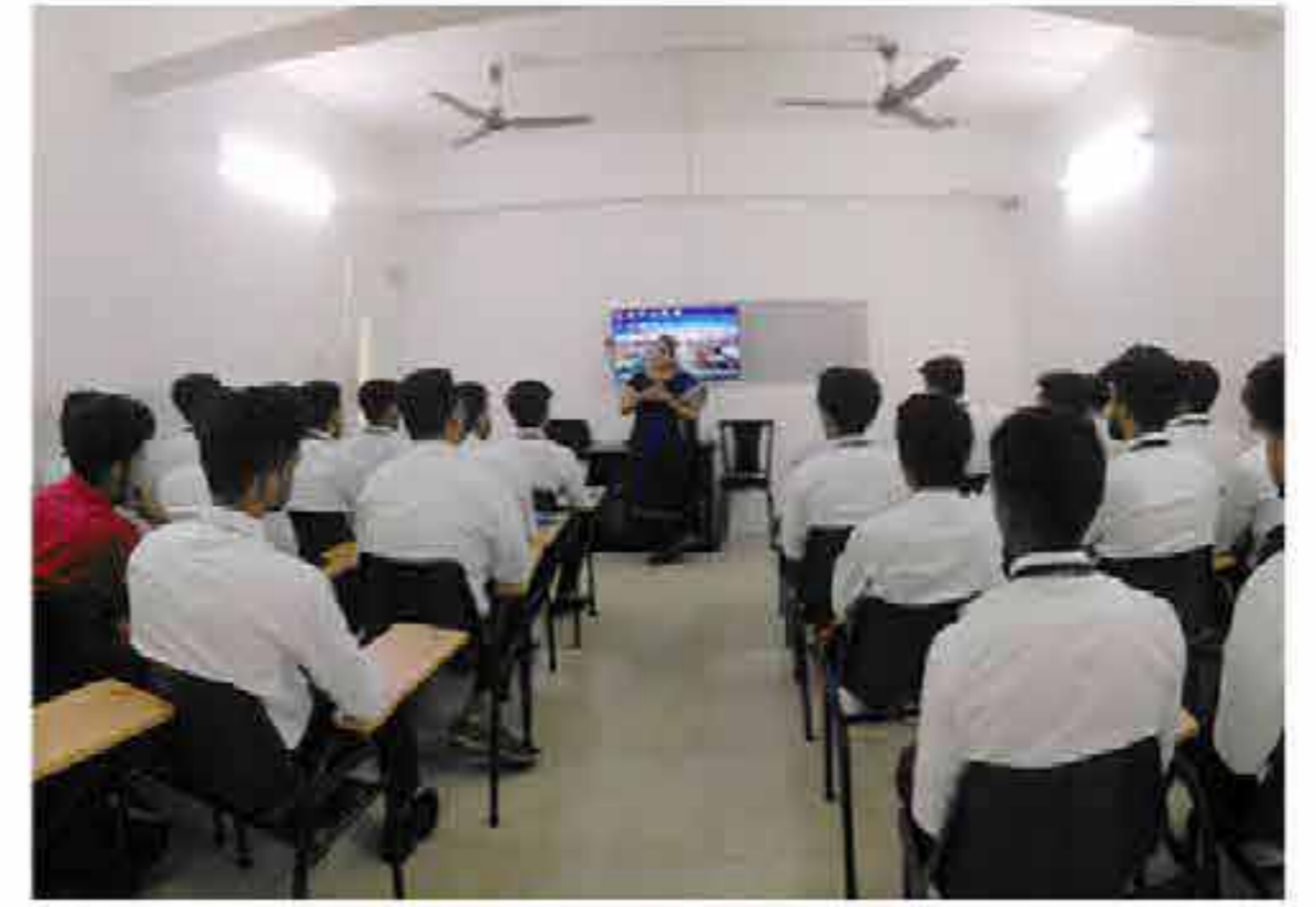
VFL on the topic "Containerization & Cargo Movements"