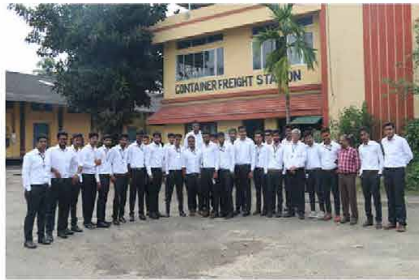
Industry Visit to Kerala State Warehouse Corporation (KWCL) Petta Unit, Ernakulam