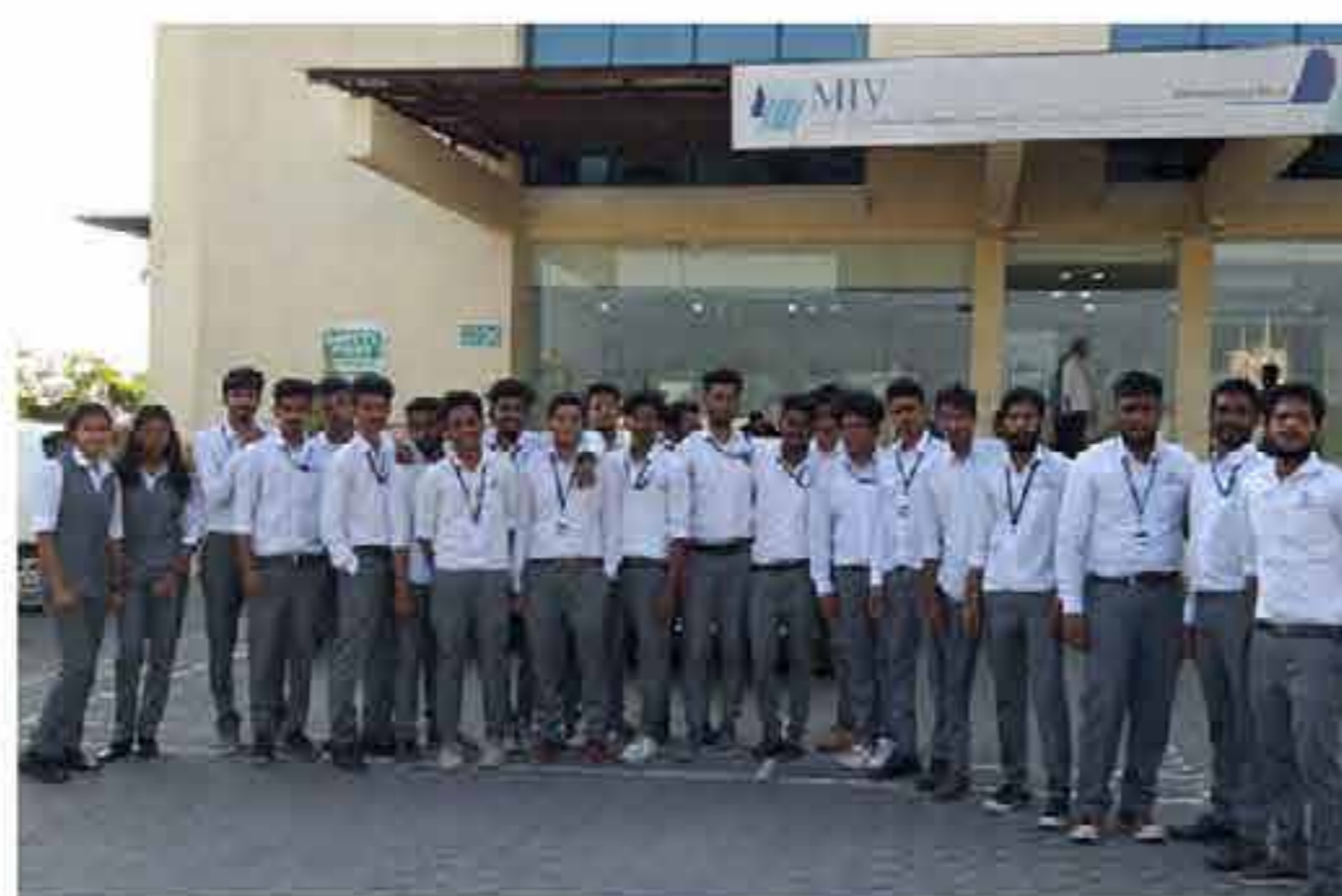
Industry Visit to MIV CFS, Vallarpadam, Cochin