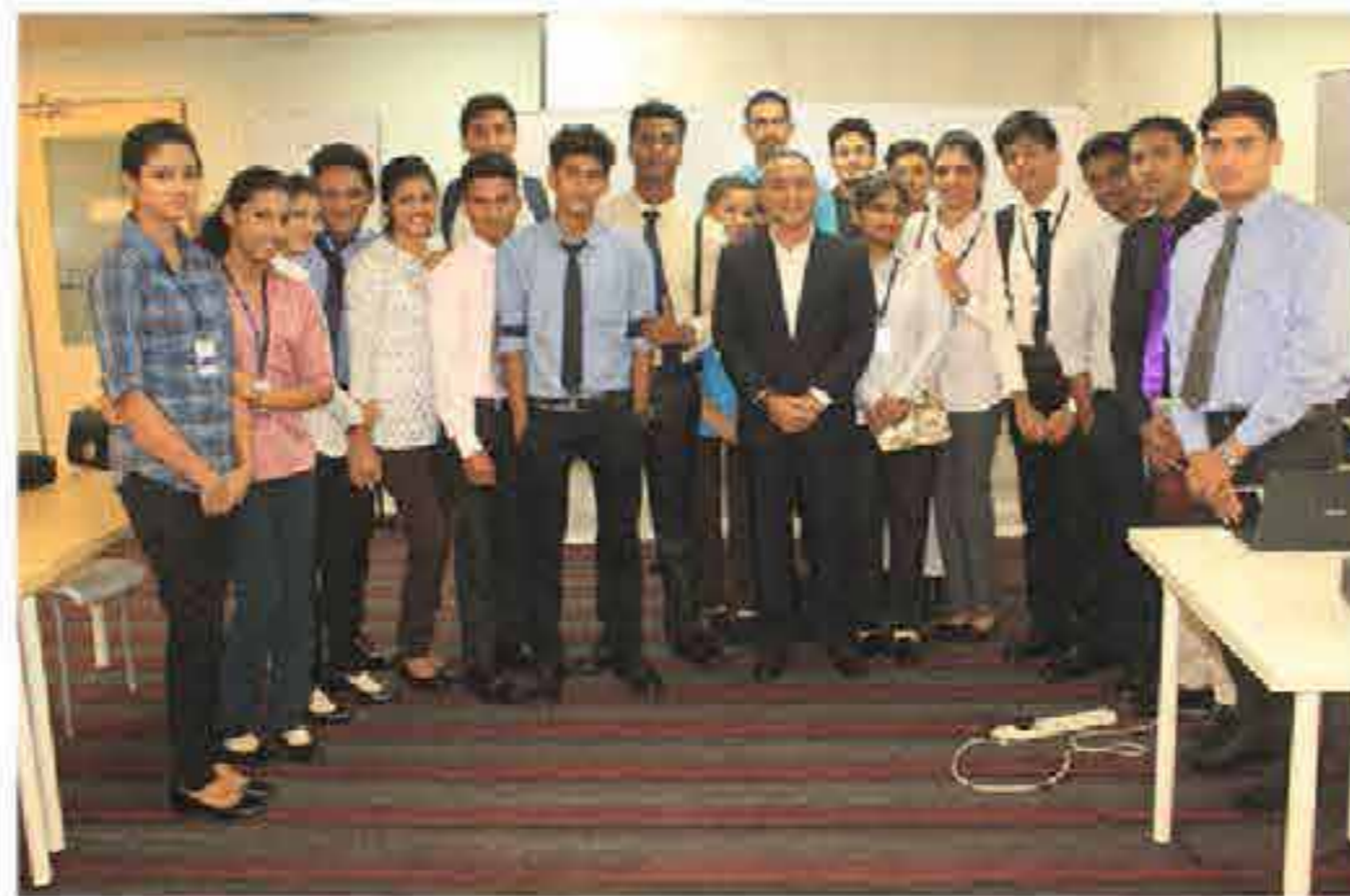
Cruise Training at Kuala Lumpur, Malaysia