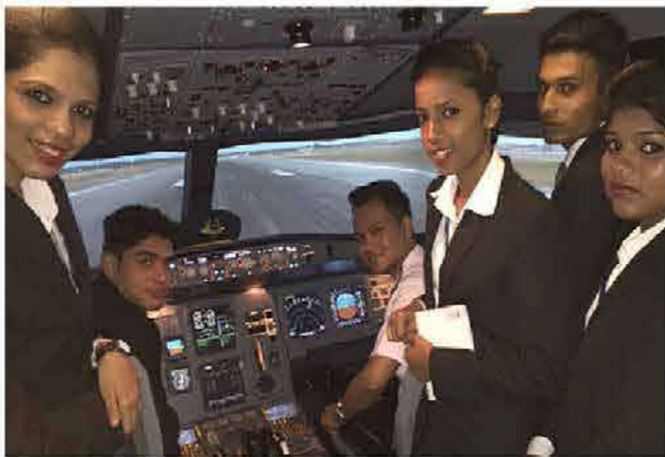
Simulator Experience in Airbus A350