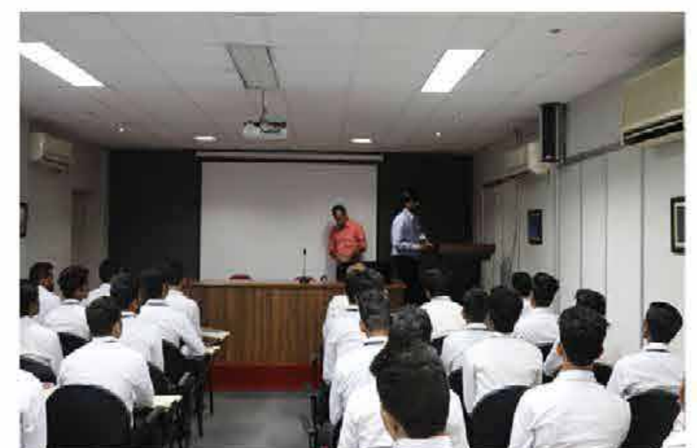
Training at Customs House, Cochin