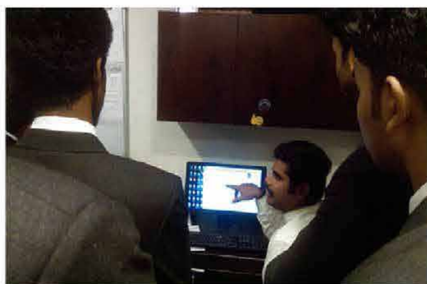
Computerised Reservation System (CRS) Training