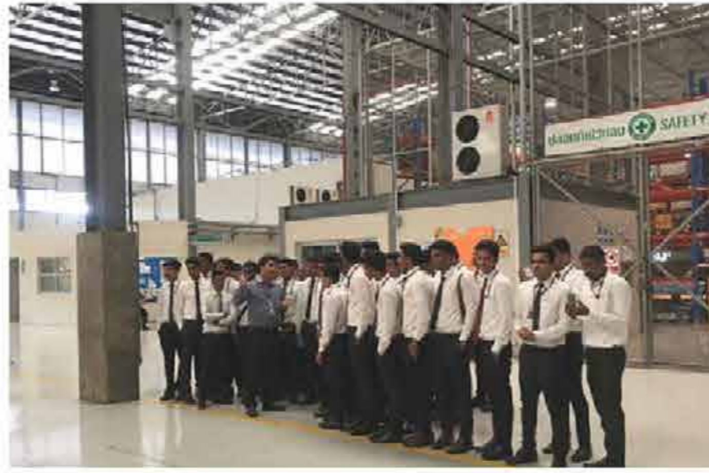
Industry Visit to Airport Rail Link, Bangkok