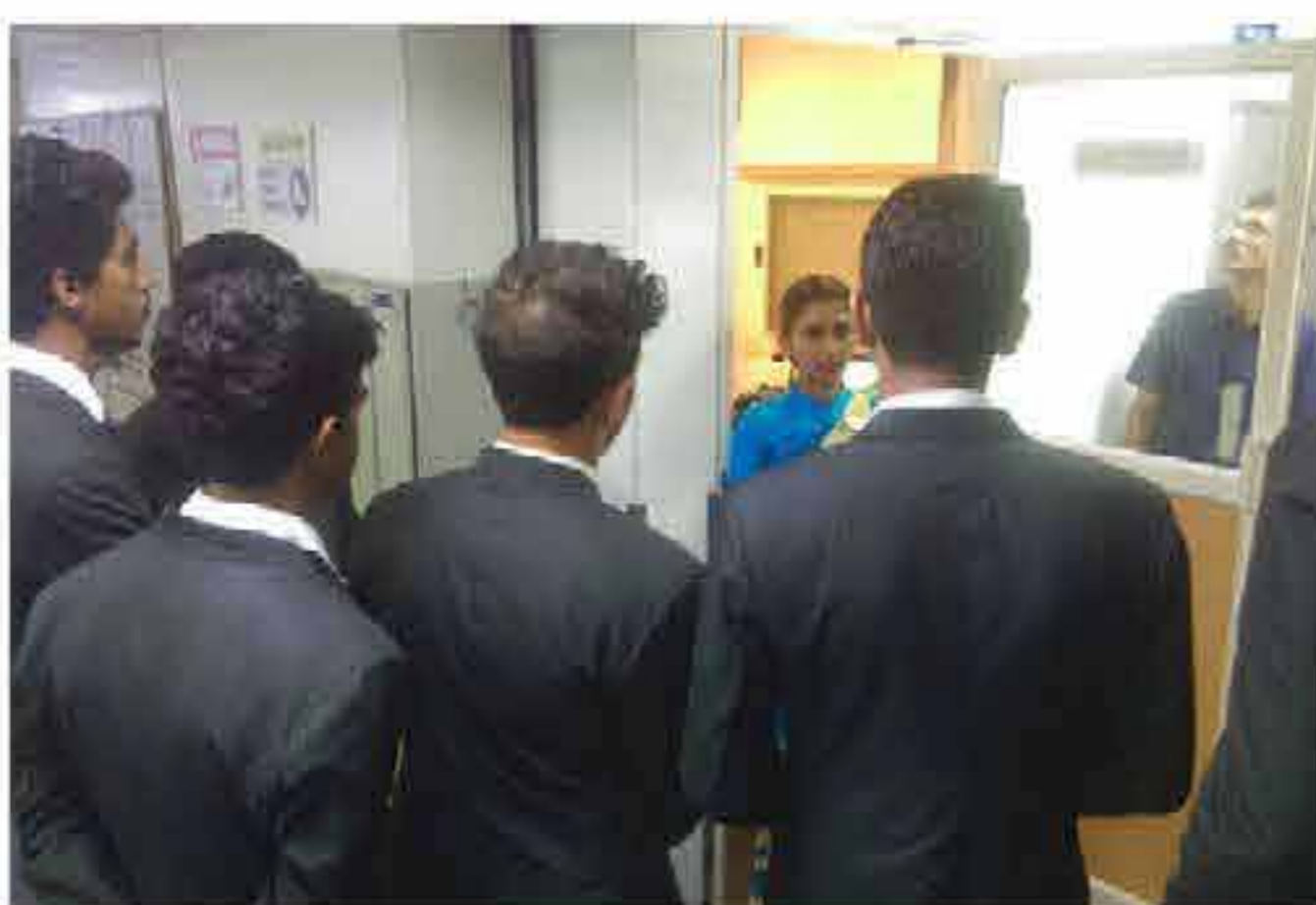
Hospitality Training at Raviz Hotel, Calicut