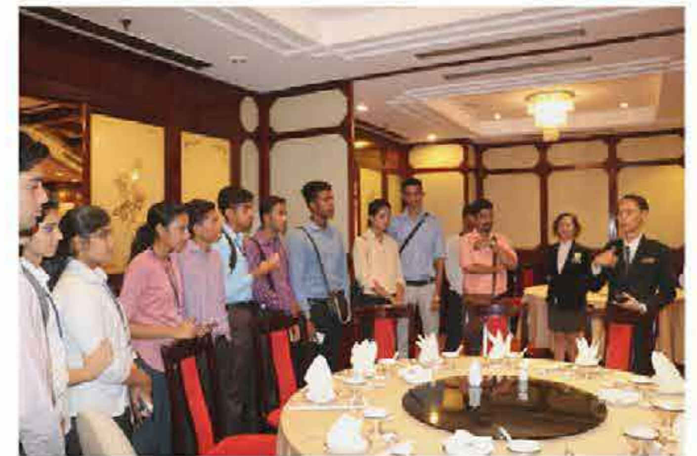
Hospitality Training at Hotel Corus, Kuala Lumpur, Malaysia